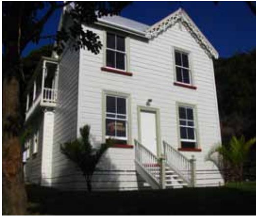
The Lodge to be restored