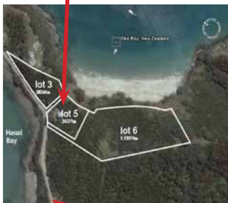
The road into the property.

Oke Bay is at Rawhiti, in the Bay of Islands, NZ. The trust owns lots 3,5,6. The land all around is either DOC or Maori land. Notice there is a beach on both sides of the property.