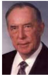
Dr Derek Prince.

Is this a Biblical vision? You bet it is! Read what Derek Prince has to say..